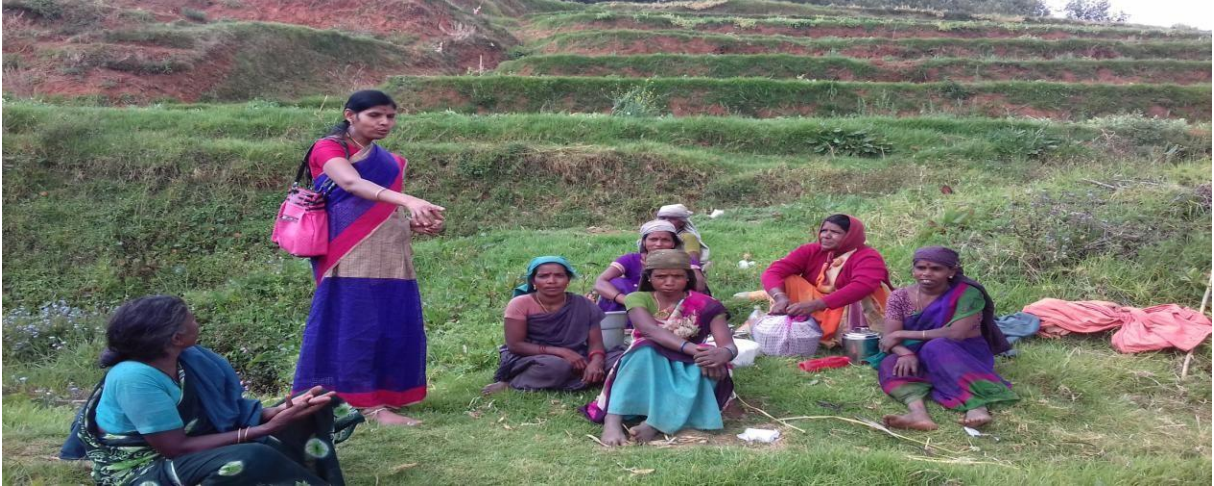
Interaction with farmers-on water pollution, organic farming- and importance of mother milk at Poondi women farmers on 27.3.2018