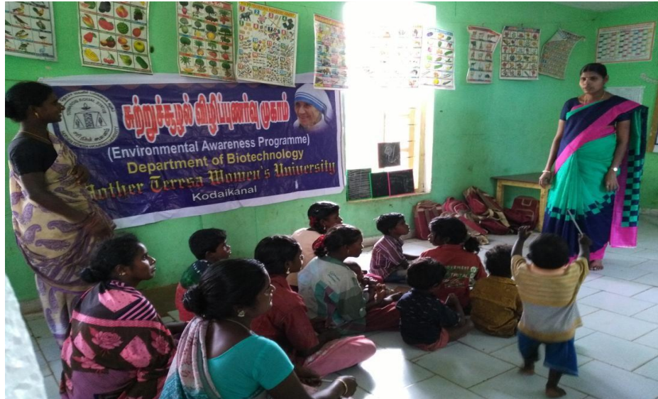
Environmental awareness programme at tribal school of Perunkadu on 3.11.2016