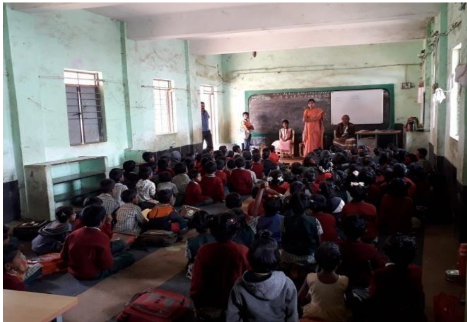
Environmental Awareness programme at Poondi middle school on 10.3.2020