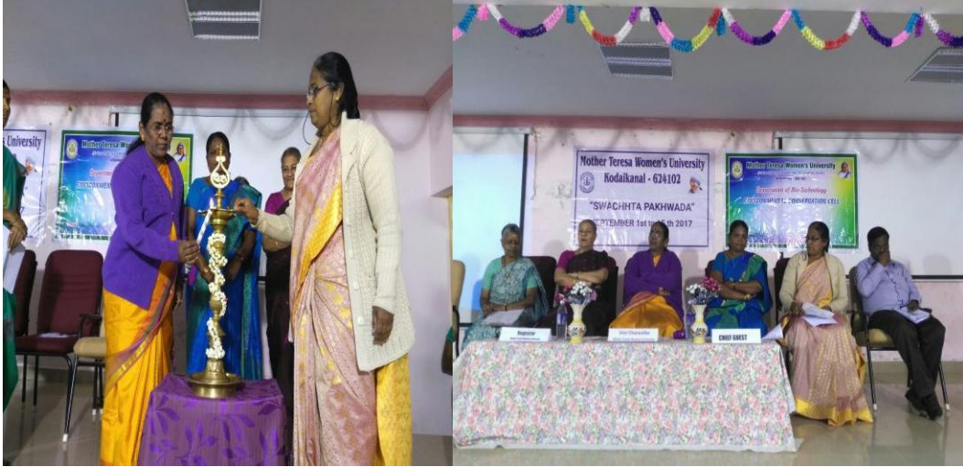
Lighting the Lamp by Honourable Vice-Chancellor