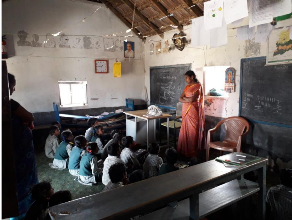
Environmental Awareness programme at Glavarai middle school on 10.3.2020