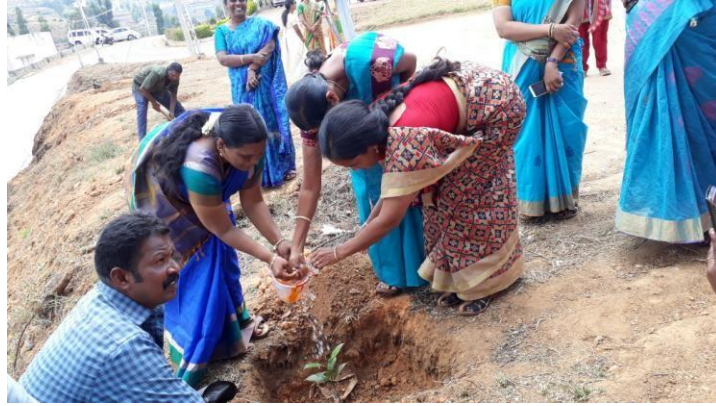
Plantlet planting by our staff members