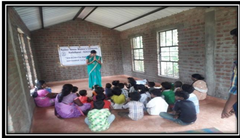
Environmental Awareness programme at Perungadu-Tribal village on 6.9.2019