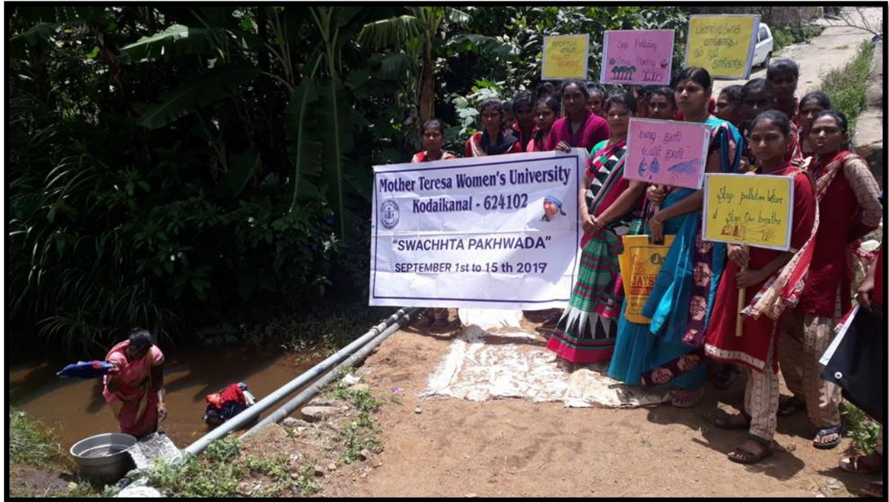
Swachhta pakhwada programme at Pallangi