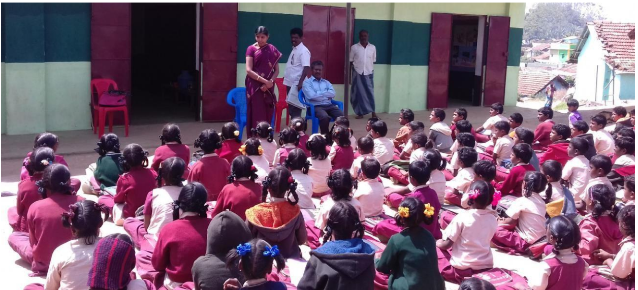
Environmental Awareness programme was conducted at Pazhamputhur middle school on 28.03.2018.