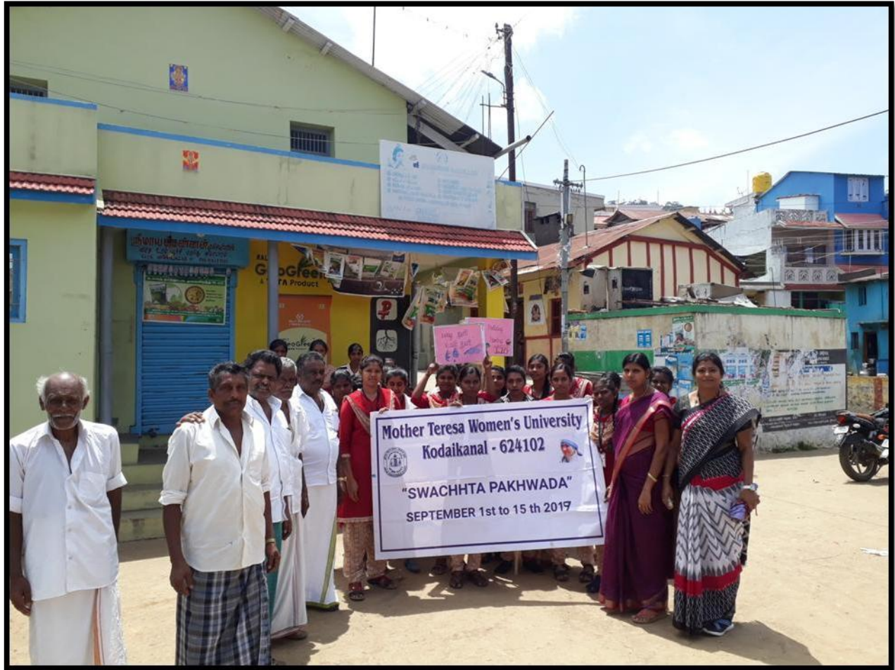
Swachhta pakhwada programme at Villpatti