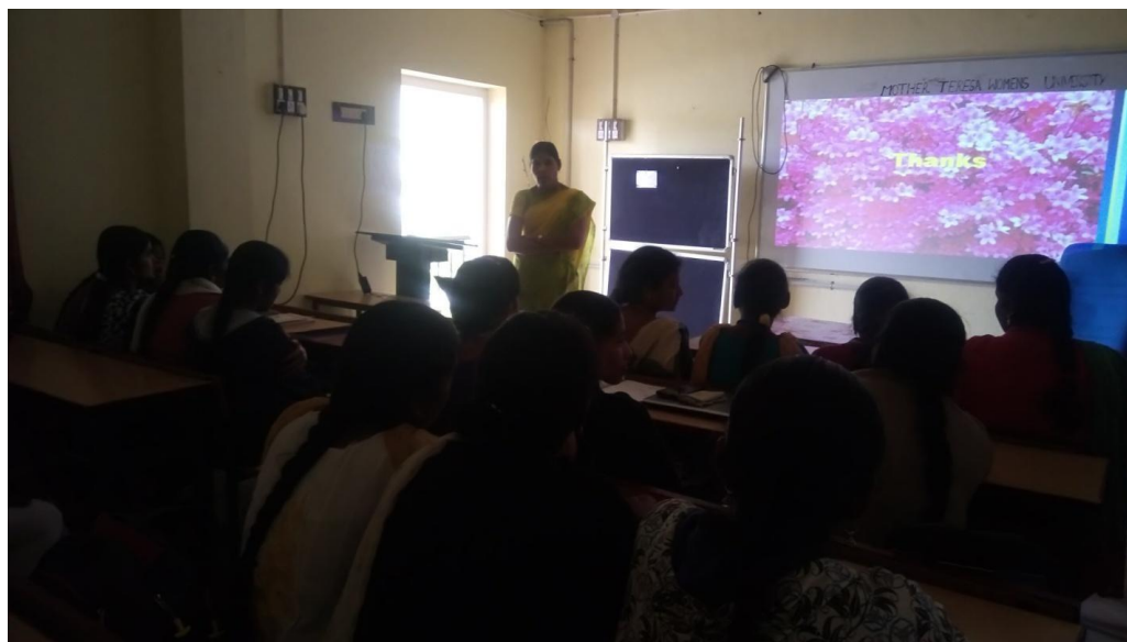
World water day celebration on march,22-2018