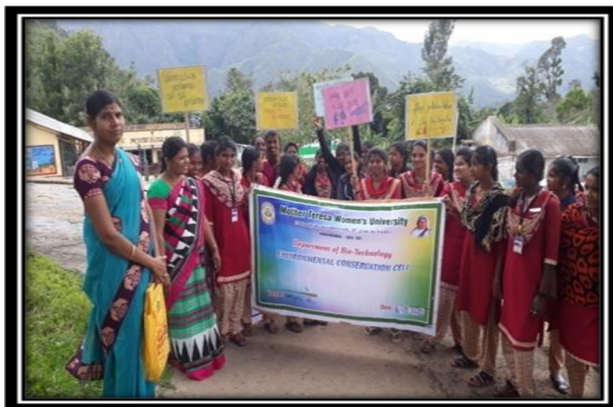
Environmental Awareness Programme at Maatupatti