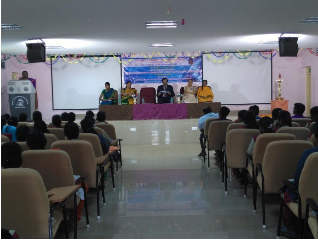
Presidential address delivered by Honourable Vice Chancellor