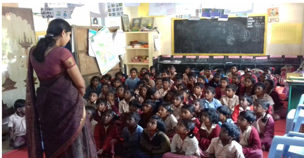
Environmental Awareness Programme at Pallangi middle school on 28.02.2018