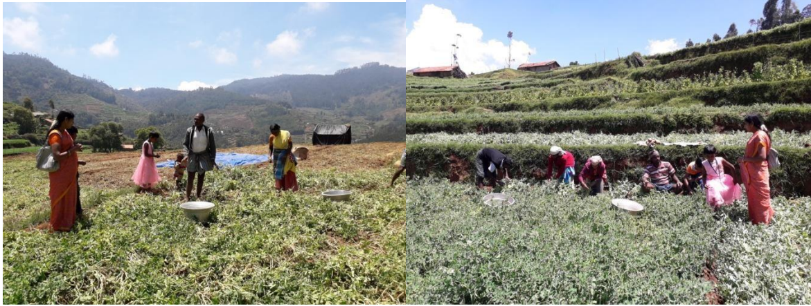
Environmental Awareness Programme at Poondi village on 10.03.2020